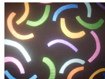
End of the Rainbow