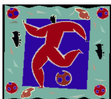
Doveton Special Soccer School Inc.

Currently in Victoria we have one affiliated sports club, the Doveton Special Soccer School Inc. Our goal is to raise awareness of the two services and increase participation.