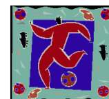
Doveton Special Soccer School

Publisher Special Olympics Victoria State Office Suite 9, Town Hall Hub 27 Bank Street Box Hill VIC 3128 Ph: (03) 9275 6922 Fax: (03) 9275 6920 info@specialolympicsvic.org.au